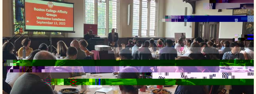
The 2022 Affinity Groups Welcome Luncheon