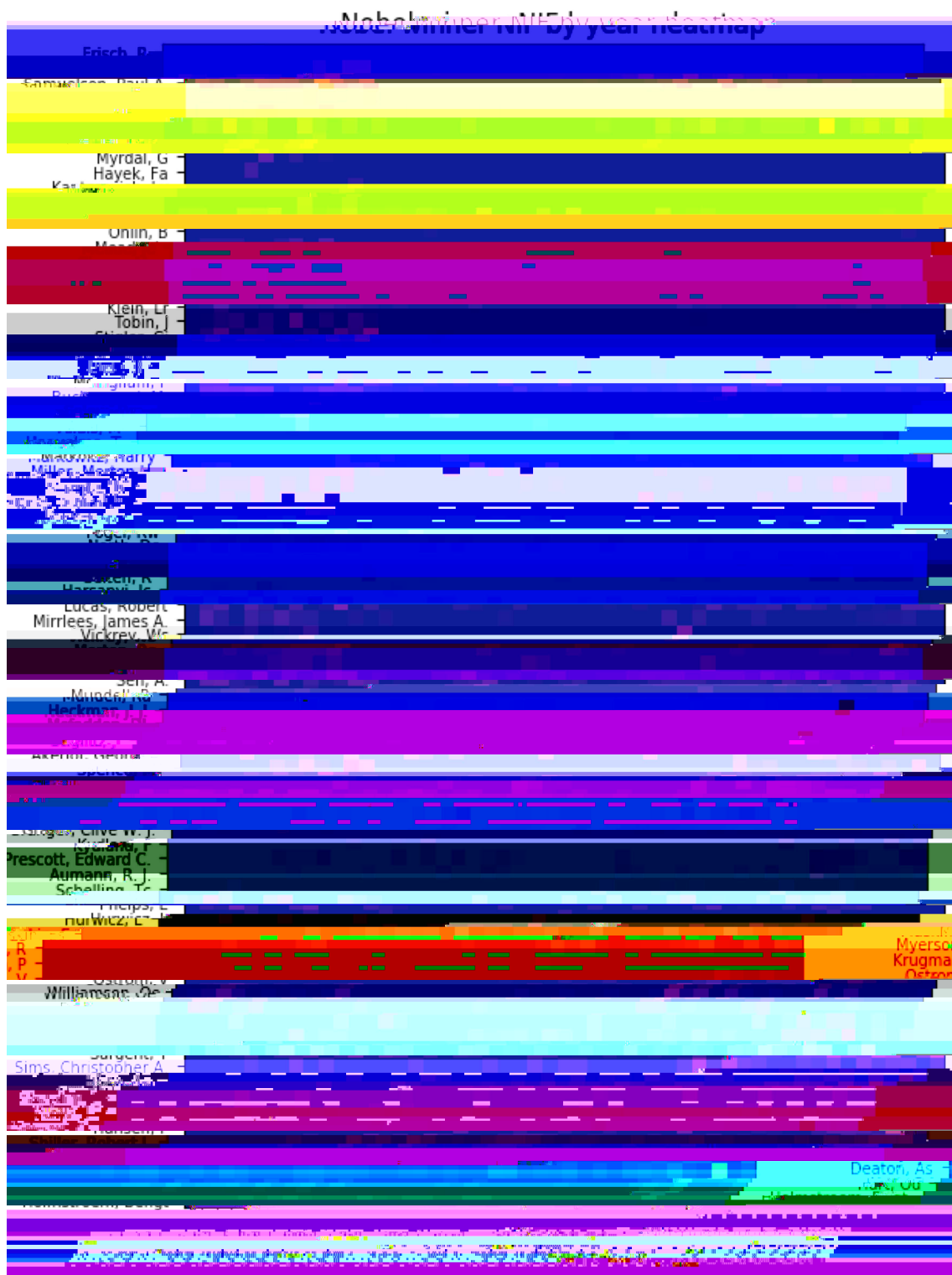
Figure 6. Color map of the NIF per year (X axis) and author (Y axis)

What we want to convey from the figure is not so much the individual features (which are not readily discernible) as the global patterns, especially with regard to the