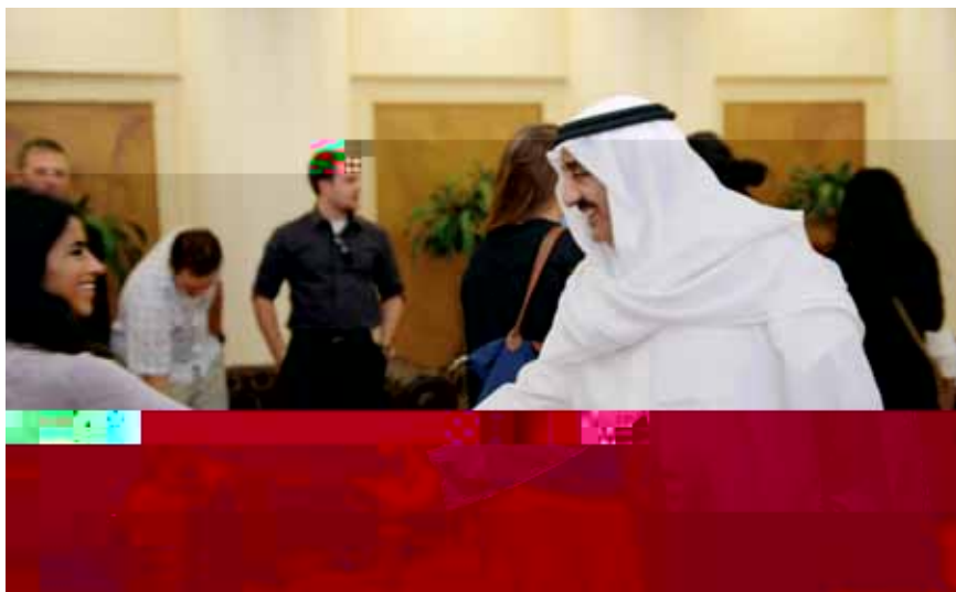
Speaker of the Kuwait National Assembly, Jassem Al-Kharafi, greets BC student

The major and its associated minor provide a well-integrated and rigorous program of study in languages, history, cultures, and politics of the many diverse societies where Islam is the majority religion or in which there are significant Muslim minorities.